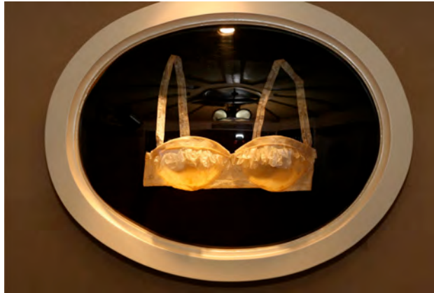
Support Group , 2007 Sausage casing, resin 77 x 16 x 51 cm - 30 x 6 x 20 inches