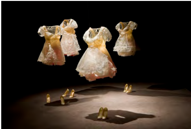
Playmates , 2006 Sausage casing, resin, pigment, acrylic medium Each dress 66 x 66 x 77 cm - 26 x 26 x 30 inches