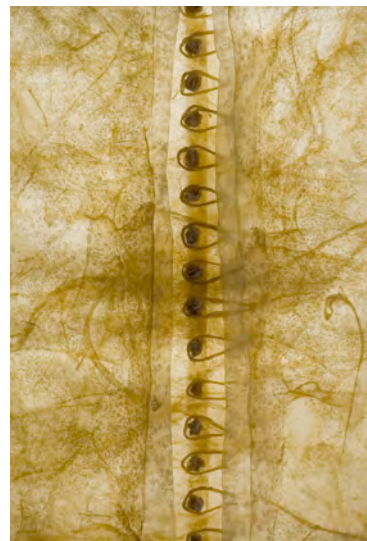
Late Bloomer , 2005 (detail) Sausage casing, resin, pigment, acrylic medium 92 x 102 x 143 cm - 36 x 40 x 4'8 inches