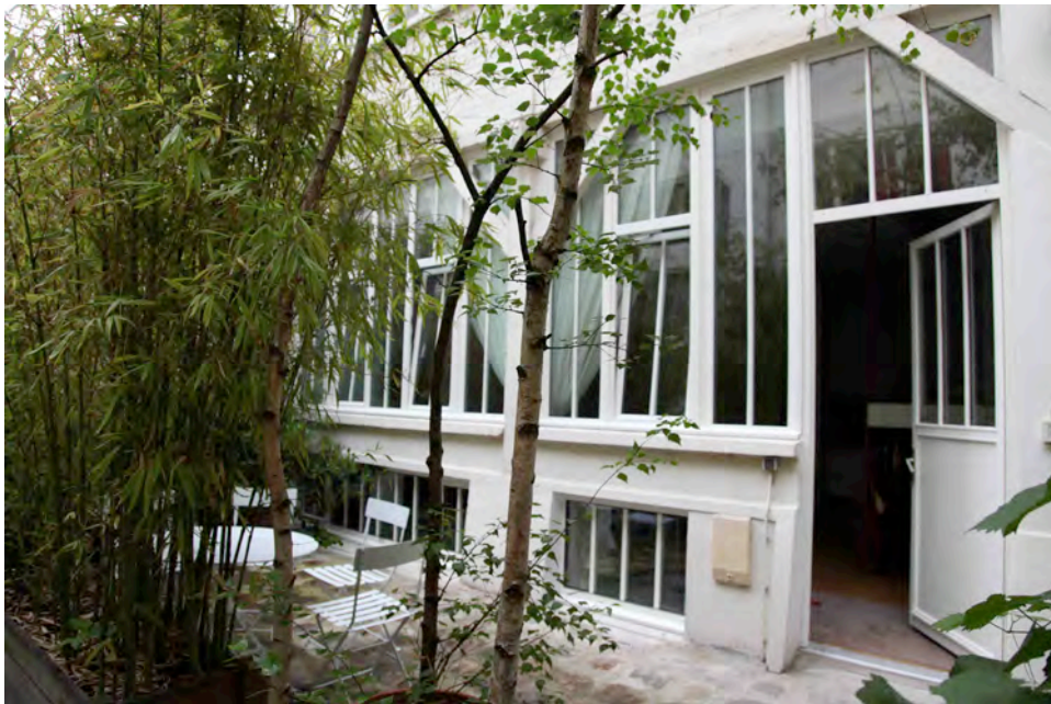
Entrance of La Découpe and Zelda Georgel's exhibition view, December 2010.