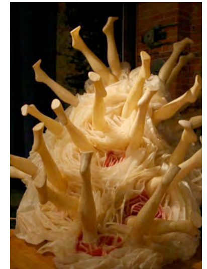
Centerfold , 2007 Sausage casing, resin, pigment, acrylic medium 15 x 18 x 23 cm - 60 x 70 x 90 inches